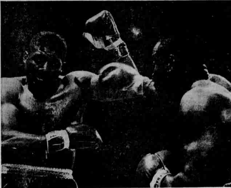
HARD RIGHT—World heavyweight champ with his right fist to Floyd Patterson during Sonny Liston, right, is shown coming in their title fight at Las Vegas last night.