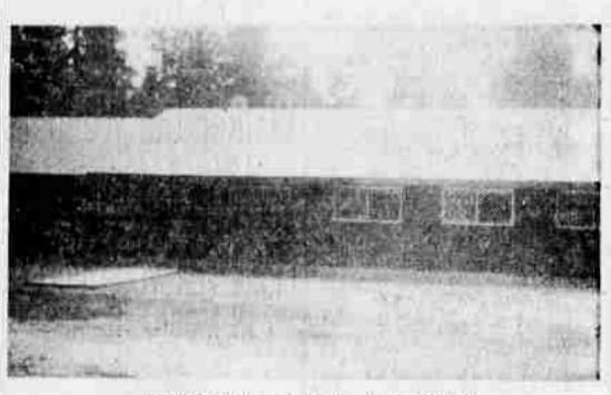
New Quarters Nearly Completed