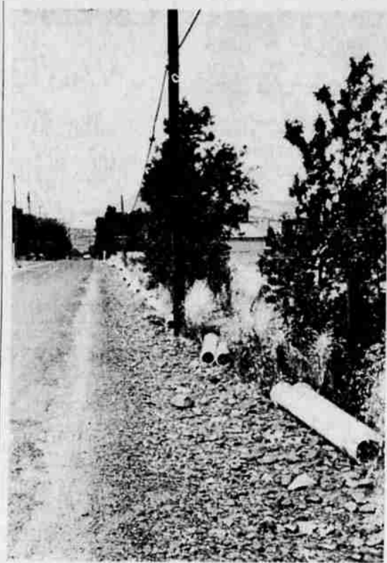
PIPELINE FOR THE NEW SYSTEM —Lengths of pipe are shown along Wagner Creek rd. near the Talent city limits as workmen last week were laying the main pipeline which will bring the city's water in from the treatment plant to users. Starting from the plant site, workmen have been digging a ditch and laying the pipe, gradually working toward the city. The ditch had not yet been extended to the part of Wagner Creek rd. shown above when this photo was taken.

that a new system be built so that water could be taken out of Wagner creek, purified in a treatment plant and distributed to users. The voters last year approved a bond issue to finance the $185,000 project, about $40,000 of which will be spent on the treatment plant.