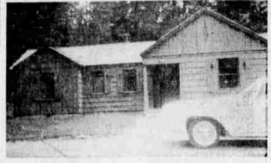
Old Forest Service Office Building