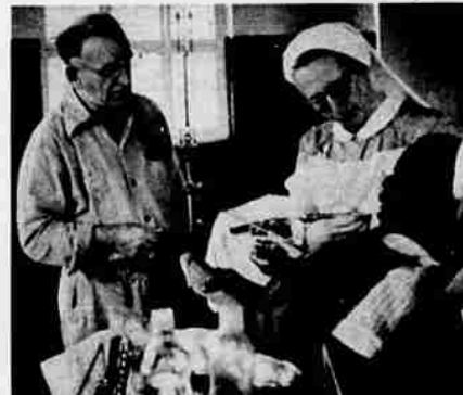
The African native is a willing patient.

A 64-YEAR-OLD dental surgeon from Rochester, N.Y., skidded his battered jungle jalopy around a muddy bend in East Africa and slammed on the brakes. The rain-soaked trail ahead was blocked solid by silent, spear-carrying natives.