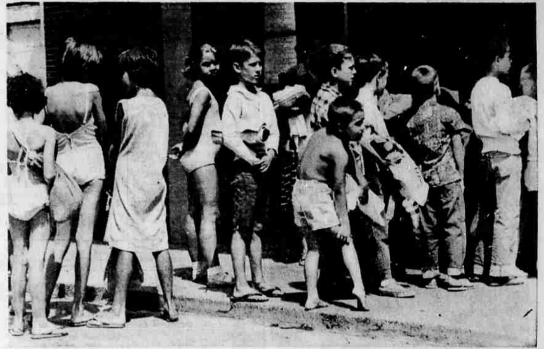
While two or three groups are receiving instruction, members of the next set of classes line up at the entrance waiting for their turn to be checked in and report to their teachers. This group of youngsters waited at the entrance to Hawthorne pool Tuesday morning, with two or three watchful mothers in the background.