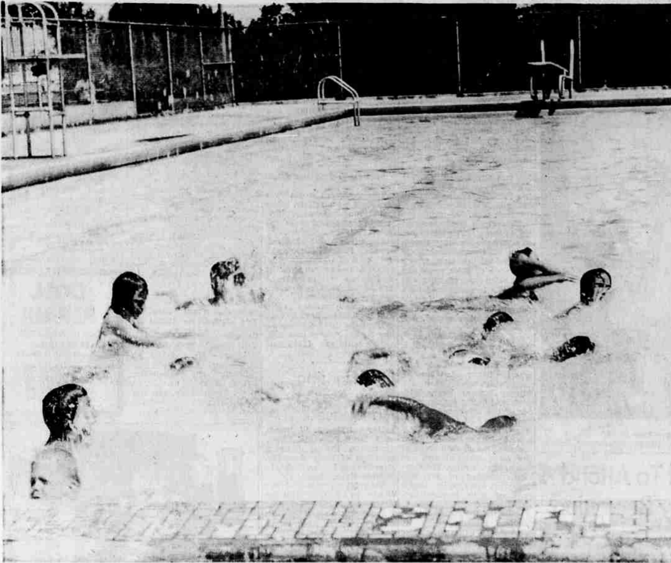
Summer is here and the city's swimming pools are filled with small children, swim teachers and the sound of splashing and churning water. At both Jackson and Hawthorne pools lessons are being given for about 200 youngsters under the supervision of the Medford Recreation department and the Jackson county chapter, American Red Cross.