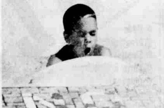
These small faces show the effort and determination put forth in balancing on the float board and splashing along under the teacher's direction.