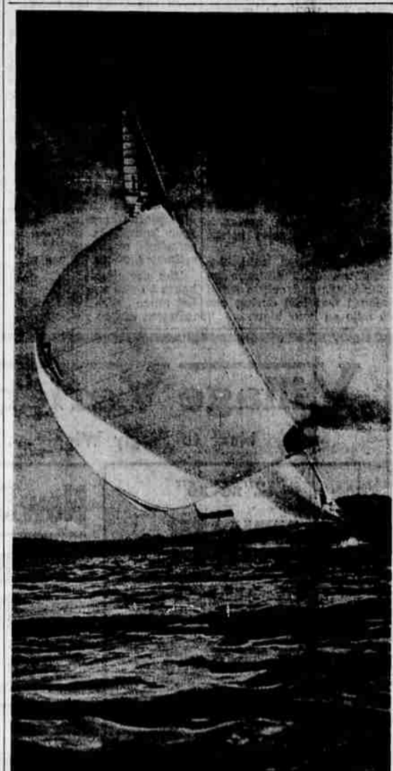
TRIAL RUN — Her spinnaker swelling in a strong wind, Sceptre, Britain's unsuccessful 1959 America's Cup challenger, glides across Firth of Clyde in the first in a series of trials against the 12-meter yacht Sovereign, a potential British challenger for the forthcoming America's Cup races. Sceptre beat Sovereign by 200 yards in the race.

Singapore progressed and at its peak boasted three sawmills, two hotels and several general stores along with the bank. But the pine stands became exhausted, sealing the town's doom. By 1895, most of the people had gone.