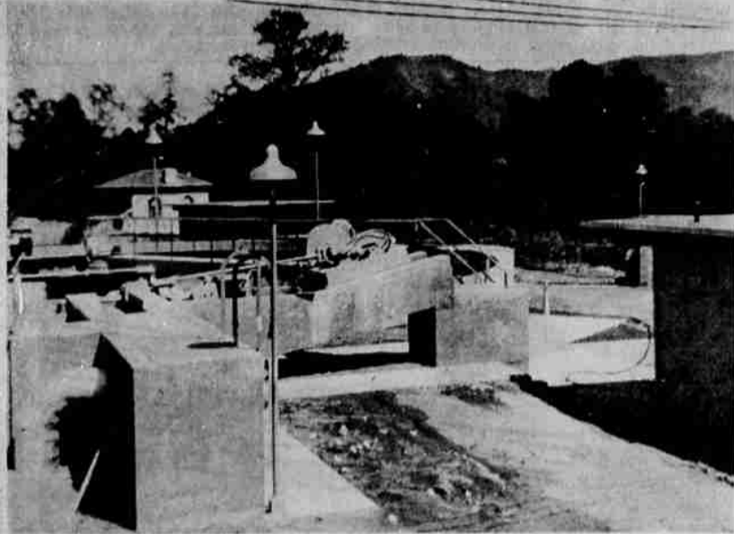
EXPANDED SYSTEM — This is part of the equipment in Grants Pass' new sewage treatment plant, which was scheduled to be given its first trial run today. In the left foreground is a sediment scraper, while at extreme right a portion of the pump and control room may be seen.