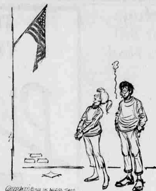
"You know, when you think about it, our flag is like abstract art. It means different things to different people!"

No Governor of Oregon in this century has served out two full terms. All elected to two terms have either died in office or resigned.—E. A.