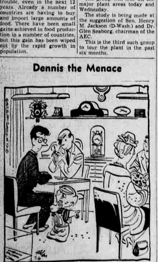
"Boy, is that lady ever mixed up! She's trying to buy carrots! In here!"