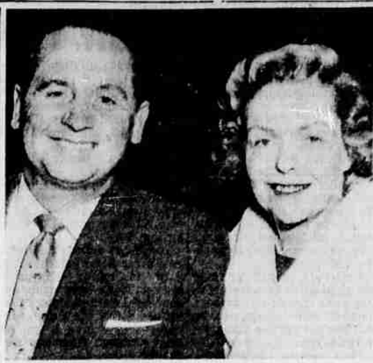
TEAM BREAKS UP—The marital breakup of one of the most successful teams in recording history has been disclosed in Los Angeles with filing of a suit for separate maintenance by singer Mary Ford against Les Paul.