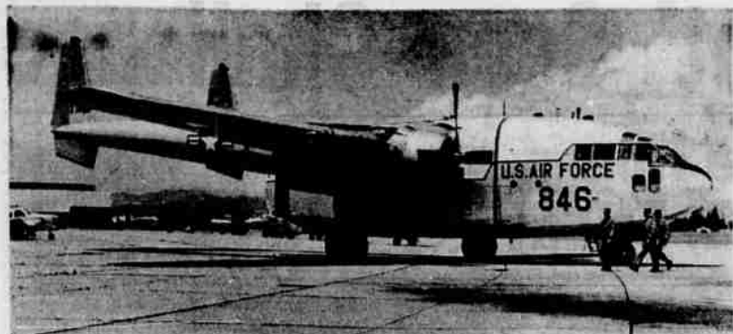
PLANE LANDS HERE—A U. S. Air Force C-119 landed at the Medford Municipal airport Sunday afternoon and stayed here about an hour. It is one of the larger planes which have landed at the local airport in recent months. The plane was flying Civil Air Patrol cadets from Portland on a routine flight to Medford where it picked up eight CAP cadets from Medford and Grants Pass and a CAP officer for their summer training session in Portland.

One line was reopened shortly before noon, allowing one of the southbound trains to resume its journey.