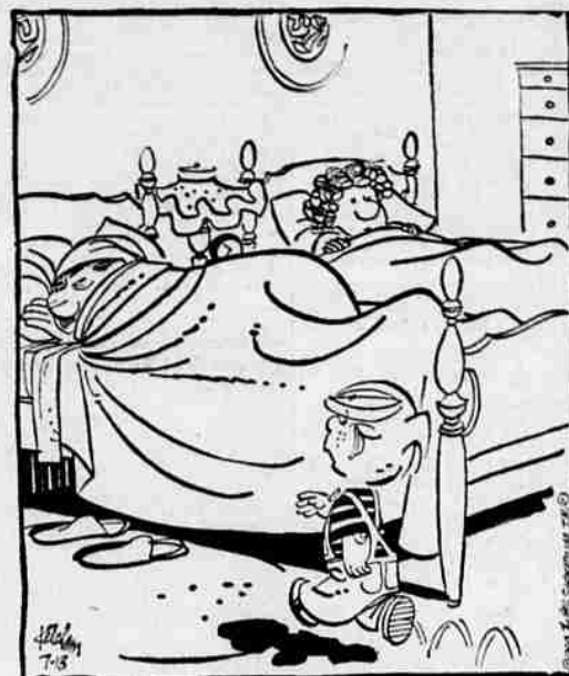
"GEE WHIZ! ARE YOU PEOPLE STILL IN BED, TOO?"

If the fisherman has not caught the limit he won't complain because of these other gifts surrounding Mt. McLoughlin. If he has, he will leave the sack at dawn to feast upon the best fish fry water has ever spawned.