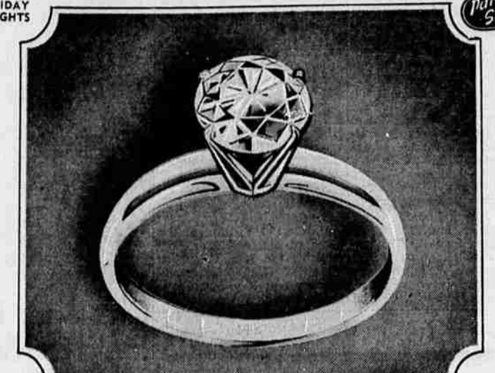
Chic "high rise" styling adds glamour to this fine diamond solitaire... 14K gold. $300

Exciting new designs... splendid new styling... and great new values!