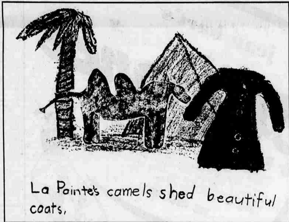
An example by an 8 year old girl