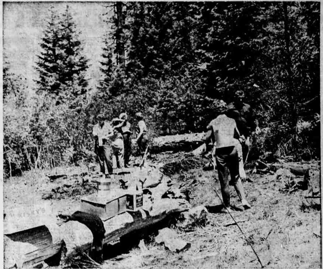
The Outdoor Education workshop spent the last three days of their session at Fish lake. The main cooking site was located in a clearing near the lake. It was soon turned into a scene of seeming confusion as everyone rushed around to gather rocks for the fire sites and wood for the fires. Class members were graded on how well they went about preparing the campsite.

There is only one county in Oregon that has an