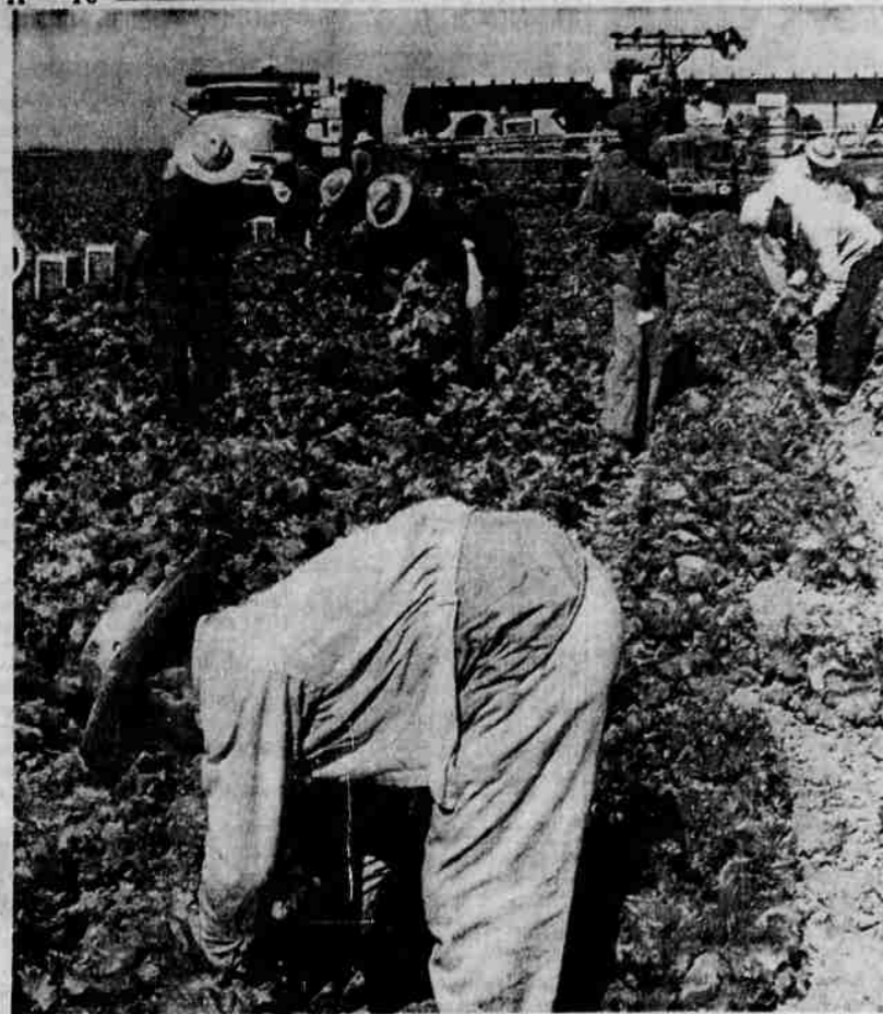
HARVEST LETTUCE—Mexican farm workers (braceros) are shown above harvesting lettuce in California's Imperial Valley in this recent picture.