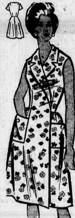
9012 SIZES 10-20 by Marianne Martin

Coatdress crispness—valuable fashion asset in a wrap dress you'll love first thing in the morning and all day! Sew-easy in pique, poplin.