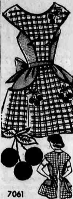
7061 by Alice Brooks

An apron that is practical and becoming, as well. Excellent protection for dress.