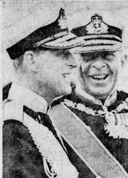
ROYALTY MEETS—Prince Philip of England, left, and King Paul of Greece chat after the king's arrival at Gatwick, England, for the start of a four-day state visit.

Liberal arts graduates and persons with skills in agriculture, public health, forestry, carpentry and other building skills, and social work, are being sought in particular. A college degree is not required.