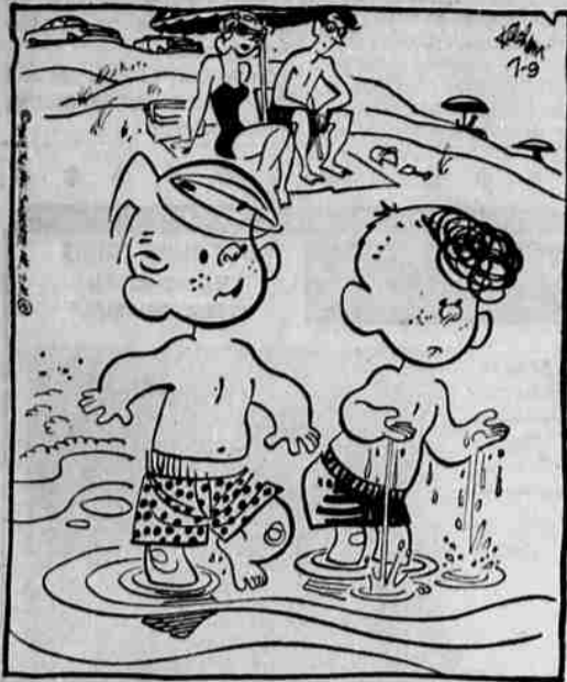
"IT LOOKS GOOD AN' IT FEELS GOOD, BUT IT TASTES AWFUL!"