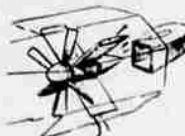
Detail from drawing of motor and propeller assembly for powerizing smoke tunnel.