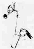
Apparatus setup used in weighing a hummingbird.

Order your copy and gift copies of SCIENTIFIC AMERICAN BOOK OF PROJECTS FOR THE AMATEUR SCIENTIST today. Send no money. Simply fill in and mail the coupon. When the mailman brings your book examine it for 14 days at no risk. If you are not altogether delighted, return the book(s) and owe nothing. Otherwise, we'll bill you at $5.95 plus postage. Send off the coupon today and look forward to countless hours of adventure on the highroads and byways of 20th century science.