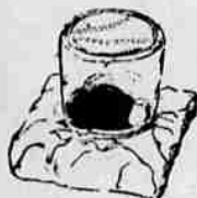
A cloud chamber of the diffusion type made from a peanut-butter jar.

F OR THE DEVOTED AMATEUR of twentieth-century science, a magnificent book — the first of its kind — has just been published.