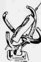
Sundial for telling clock time.

There has never been a science-at-home book like this. Every project — whether it relates to the atom or shows you how to raise butterflies for scientific investigation — deals with matters that concern the professional scientist today. You discover the valuable contributions to science that amateurs around the country are making — and how you get in on the excitement.