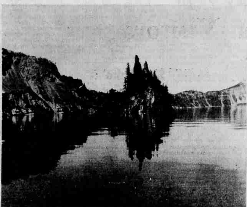
ON LAKE SURFACE—This picture was taken looking southwestward toward Phantom Ship on Crater Lake. Watchman peak is at far right in picture, and Rim village is directly behind the Phantom Ship.