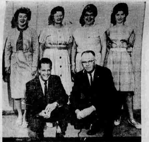
CRATER LAKE MOTORS OFFICE FORCE