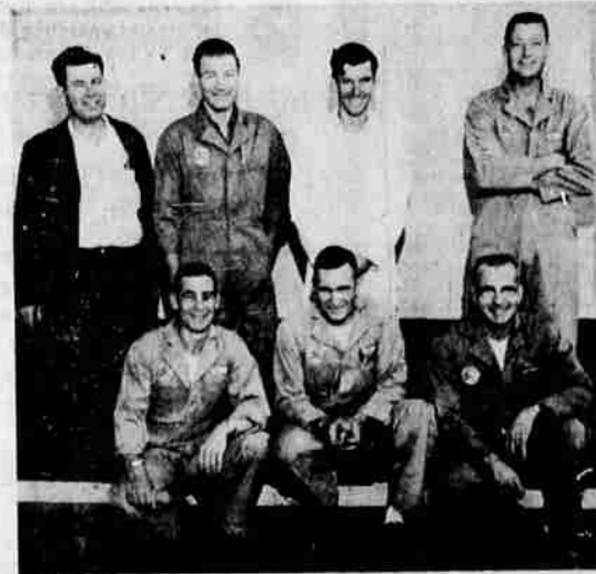
CRATER LAKE MOTORS BODY SHOP