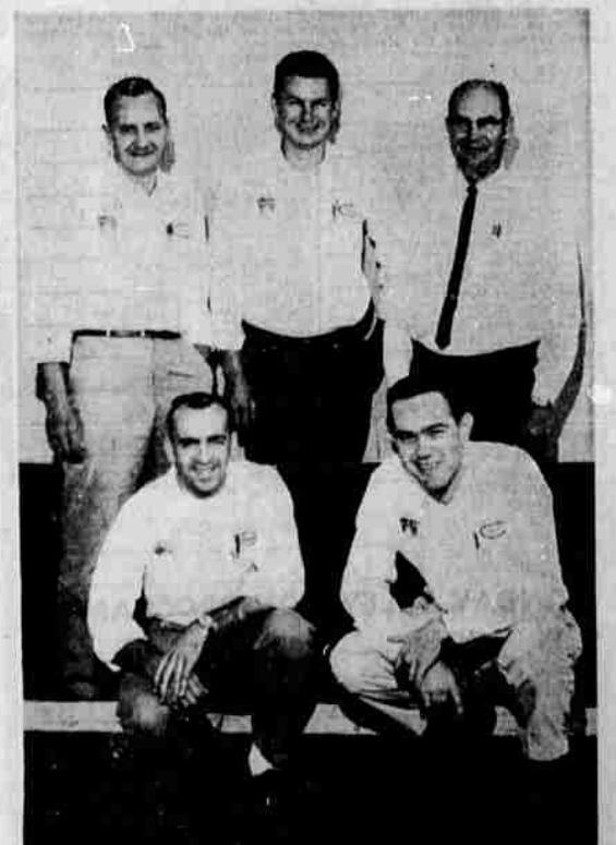
CRATER LAKE MOTORS PARTS DEPARTMENT