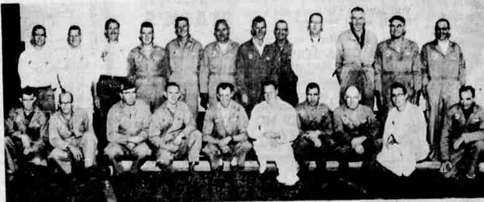
CRATER LAKE MOTORS SHOP DEPARTMENT