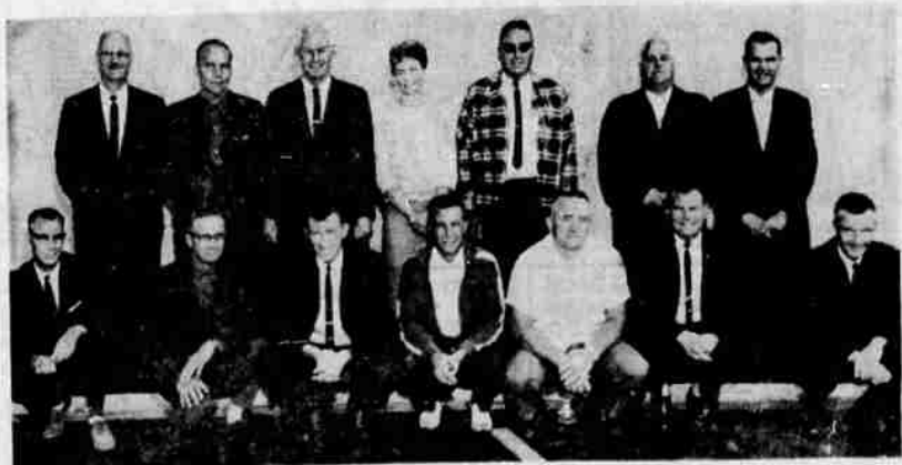
CRATER LAKE MOTORS NEW AND USED CAR SALES GROUP