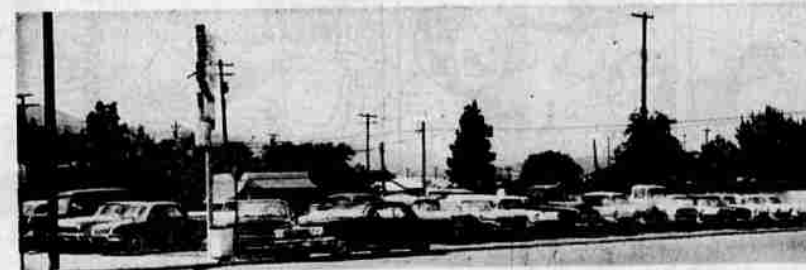
Here are four familiar locations of Crater Lake Motors' operations. Top-to-bottom: General offices and new car display room at Sixth and Fir streets, new car display lot at Main and Fir, headquarters for Ford truck sales and service, used car lot at Eighth and Fir streets and, bottom, used car lot at Second and Pine streets in Central Point.