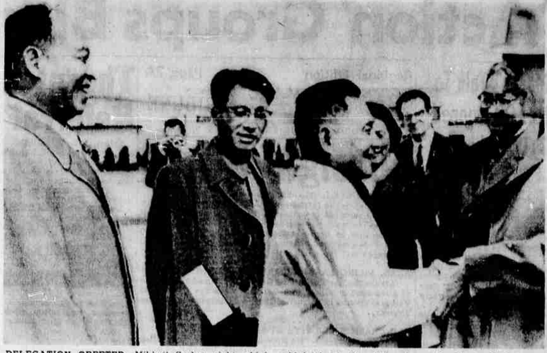
DELEGATION GREETED — Mikhail Suslov, right, chief Soviet delegate for crucial ideological talks, is shown as he greeted members of the Red Chinese delegation at Moscow airport today. Suslov is shaking hands with Red China's

WINS CONFIDENCE Rome — UPI — Italian Premier Giovanni Leone tonight won a Senate confidence vote for his stop-gap cabinet that is designed to see this politically-divided nation through the summer.