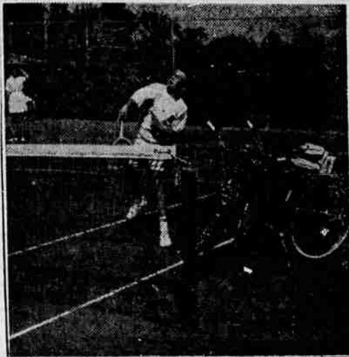
ECONOMICAL —For traveling 'round town or to the country, or just riding around—modern youngsters find that bicycles are their best bet for economy transportation as well as for fun. And bike riding is a pleasurable way to keep physically fit.