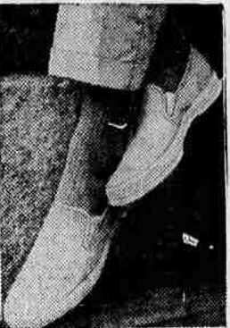
FOOTWEAR —Casual and comfortable for the many activities afoot this summer are these easy-on, easy-off slippers. Hand-washable, they have sailcloth uppers with lastex gores, arch cushions and crepe type outsoles (perfect for the boating crew).

OIL PERMIT ASKED Portland — (UPI) — A fourth major oil company, Richfield, has filed for a permit to explore off-shore territories of Oregon for oil.