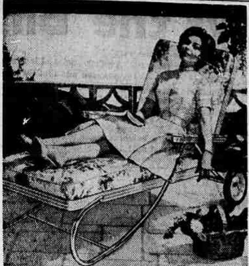
WELCOME ADDITION —Custom comfort is built into this smartly styled, adjustable-back chaise. Innerspring construction of seat and back cushions, gaily-patterned, fabric-supported vinyl zippered upholstery covers and sturdy construction make this handsome outdoor furniture unit a welcome addition to any garden or patio setting.—By The Bunting Co.

OIL PERMIT ASKED Portland — (UPI) — A fourth major oil company, Richfield, has filed for a permit to explore off-shore territories of Oregon for oil.