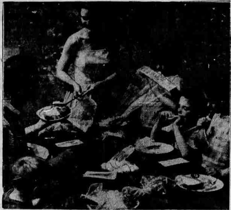
PICNIC FUN FOR EVERYONE —Almost any food and drink can be prepared in advance, packaged in convenient plastic, snap-off bags and refrigerated—ready for a certain picnic, or an "instant" one. These bags, in assorted sizes, come packaged on a roll, just snap-off the ones you need. They're small enough for a sandwich, or roomy enough to hold a wet bathing suit. By Lion Packaging Products Co., Inc.