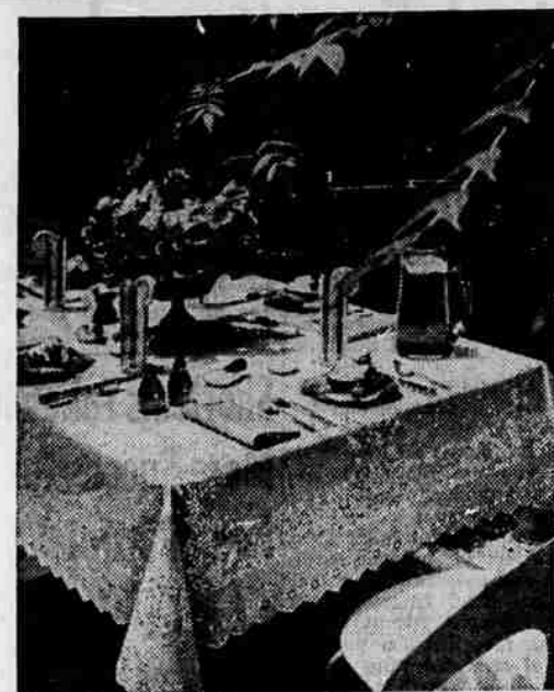
CAREFREE CLOTH —Dining al fresco can be elegant-looking, yet a breeze to care for. Here is a dainty cloth that resembles eyelet work; it can be spot cleaned, wiped off with a damp sponge and is stain resistant. Carefree summer dining is more fun, less work with this plastic table covering.—"Millie Fleurs" Pattern by Quaker Lace Co.