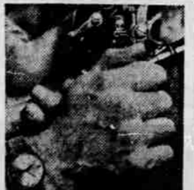
TOUGH TIMEPIECE —Rod and Reel Fans will enjoy the rugged endurance of a waterproof, shock-resistant electric watch. It's powered by a tiny energy cell that can be replaced as easily as changing the hook on a fishing line.—By Timex.