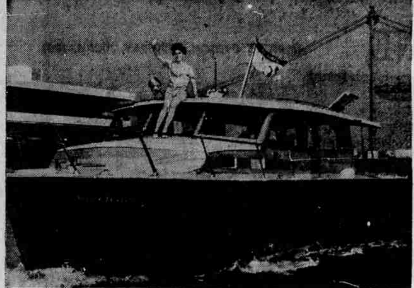
FUN IN BOATS —Down to the sea in ships, or dinghies, cruisers, sailboats or powerboats—yes, boating is the number one recreational activity on inland streams and rivers, the Gulf area, the Great Lakes, and on the Atlantic and Pacific seaboard. From aboard a streamlined cabin cruiser, a pretty sailerette waves greeting to the countless recrea-