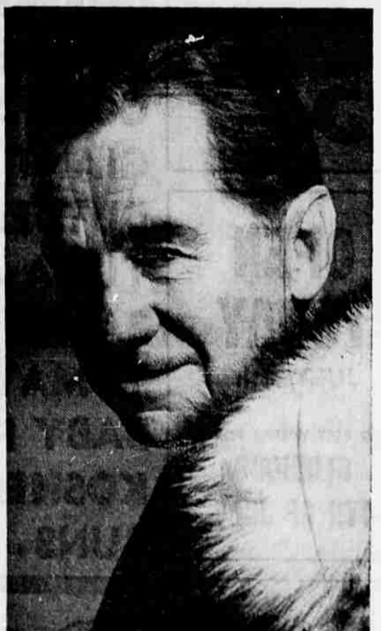
By kayak, yak back and jet

Lowell Thomas has traveled more than five million miles - by every known mode of transport - for the CBS Radio Network. He's a living legend, an author-reporter-explorer whose feats make modern history. Weekday evenings Lowell Thomas comes on with his unique reports of the day's news. This kind of alert, distinguished coverage fills our broadcast day. We tell what's happening here in town, across the nation, everywhere. We tell it first and best, paced by CBS Radio News on the hour and CBS Radio NETALERT around the clock.