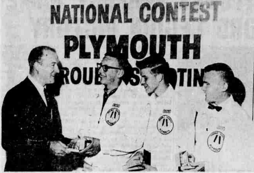
MEDFORD STUDENT MECHANICS HONORED. Recognition as two of the nation's most talented student automobile mechanics in the 1963 National Plymouth Trouble Shooting Contest went to these youngsters from Medford (Oregon) Senior High School.

TOTAL RETAIL DOLLAR VOLUME ROSE SUBSTANTIALLY during the 7-day period ended Wednesday, June 26, above the corresponding week last year. Dun & Bradstreet reported today. National Percentage Changes varied from the corresponding levels of a year ago by the following percentages: plus 4 to plus 8%. Regional Percentage Changes varied from the comparable levels of a year ago by the following percentages: New England 0 to plus 4; East South Central plus 1 to plus 3; West South Central and Mountain plus 3 to plus 7; East North Central and Pacific plus 4 to plus 8; Middle