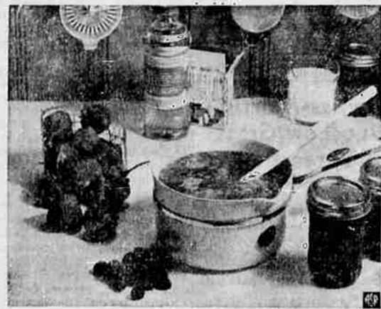
COOL WAY TO MAKE JAM. Several years ago, the United States Department of Agriculture pioneered the research in a method of making uncooked jams.