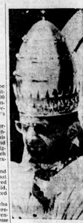
POPE PAUL VI Delivers Sermon