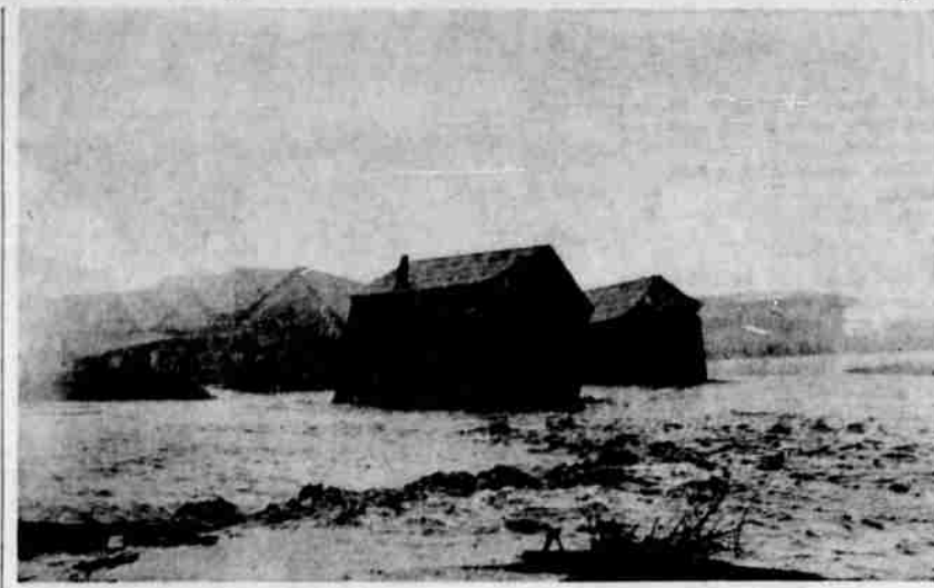
THE END OF CHINATOWN —Yreka, Calif., once had its own Chinatown, located near Highway 99 in the block now occupied by the Yreka laundry and other business firms. It burned several times, but was finally wiped out by a flood in 1890. The above photo was taken during the flood, on Feb. 4, 1890. Subsequently, all the buildings were washed down Yreka creek. (Siskiyou County Museum photo).

They always rode in a horsedrawn buggy, bowing and smiling to the people as the procession wound its way through town to the cemetery. The Chinese burial custom was odd compared to the American way. Everyone was invited, a brass band played and thousands of red papers with tiny holes punched in them were strewn from the home of the deceased to the