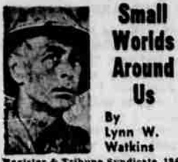
Register & Tribune Syndicate, 1963

They will compete with lumberjacks from the United States and Canada for $5,000 in prize money and trophies.