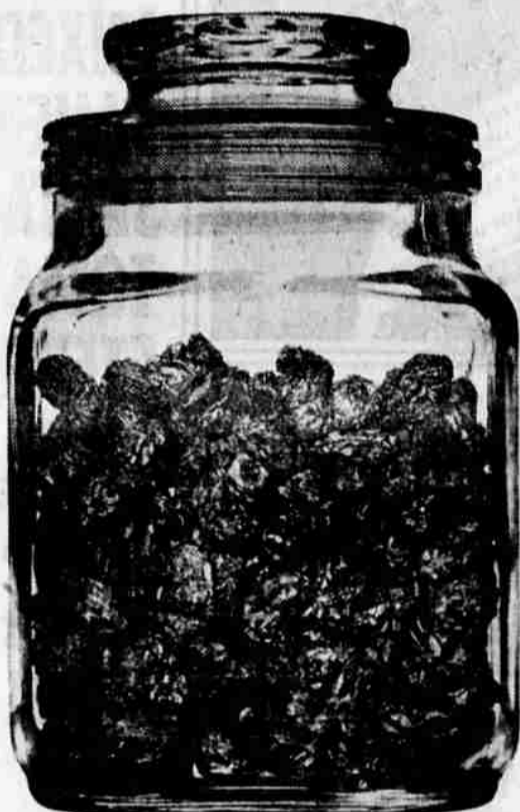
THEY'LL HOLD RAISINS...