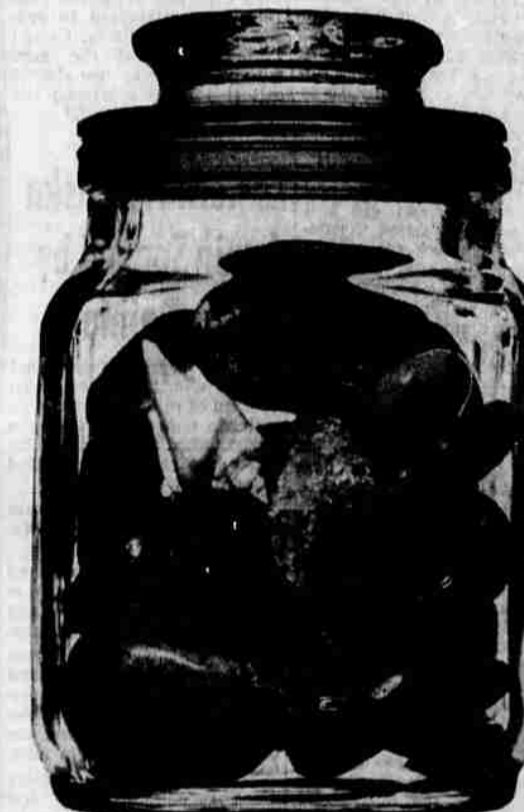
PRETTY STONES YOUR LITTLE GIRL FOUND IN THE BACKYARD...