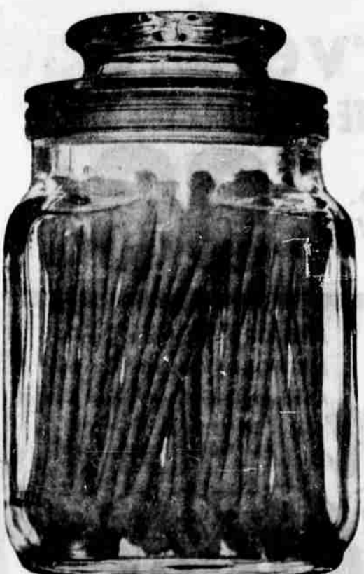
COTTON SWABS FOR THE BABY...