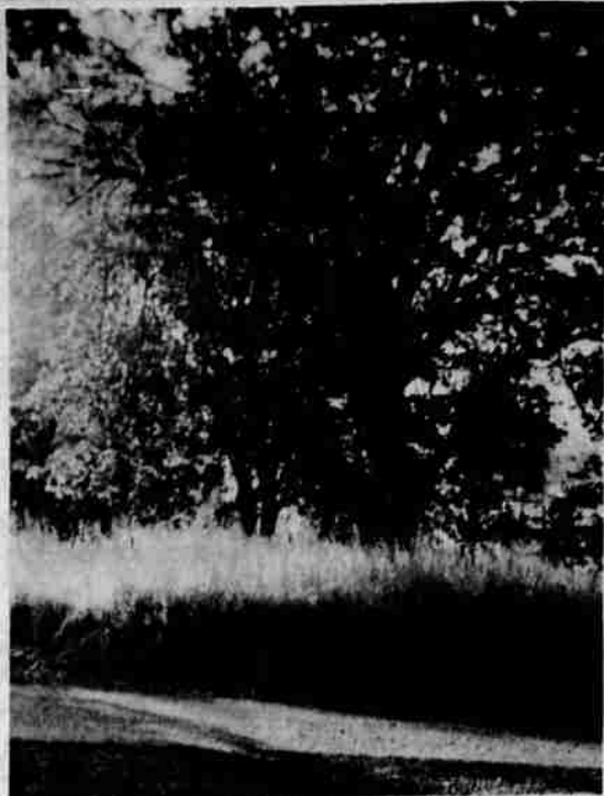
FIRE HAZARD —Tall dry grass constitutes a serious fire hazard during summer months. Such a condition on vacant lots and other property is in violation of Gold Hill city ordinance 122, which requires owners to cut down any tall dry grass, weeds or other growth. Individuals are responsible for any damage to someone else's property as a result of a fire.