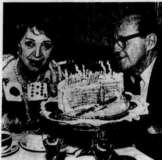
BIRTHDAY PARTY —Mary Livingston claims she's much younger than husband Jack Benny's unchanging 39, and she holds a candy-coated 21 hand to prove it. She and Benny celebrated her birthday in Las Vegas this week.