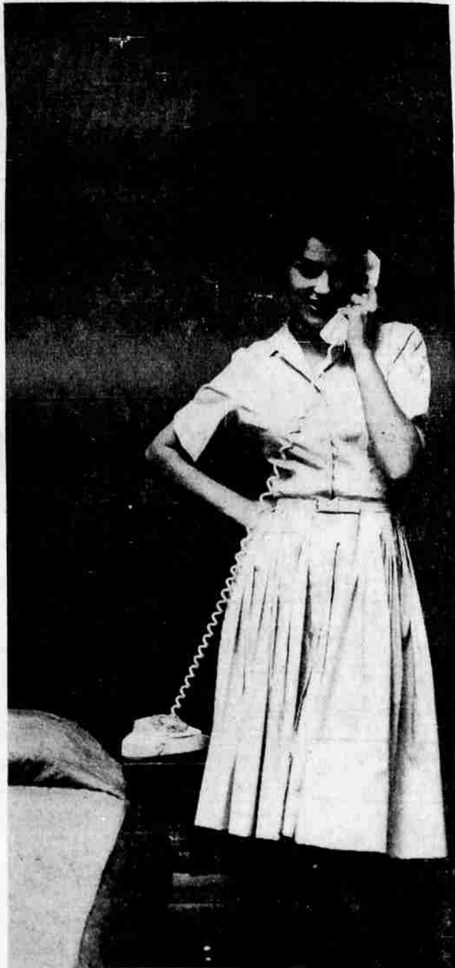
and not heard.