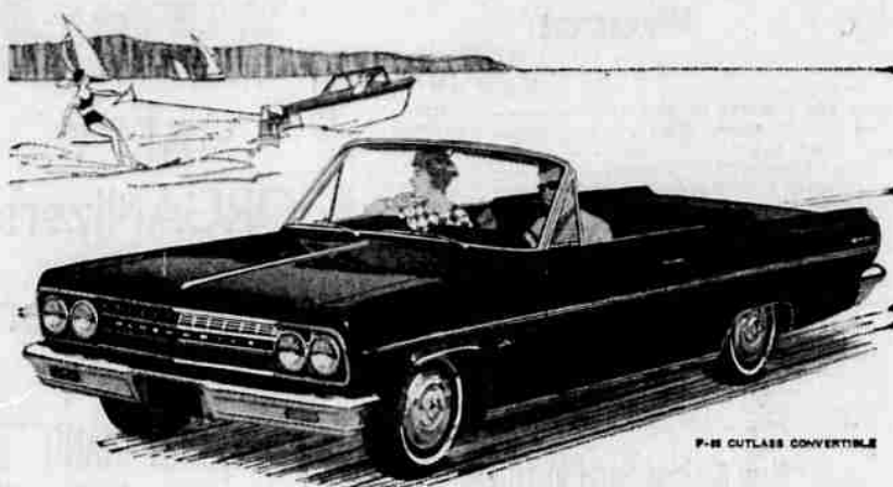
F-85 OUTLASS CONVERTIBLE