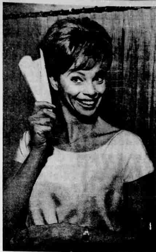
FIRST STEP - Actress Juliet Prowse, shown here Tuesday, took the first step to becoming a citizen of the United States Wednesday, when she filled out her first papers at the Immigration and Naturalization Service in Hollywood. Miss Prowse was born in Bombay, India, and was brought to America by 20th Century-Fox Studios to appear opposite Frank Sinatra and Shirley MacLaine in "Can Can."