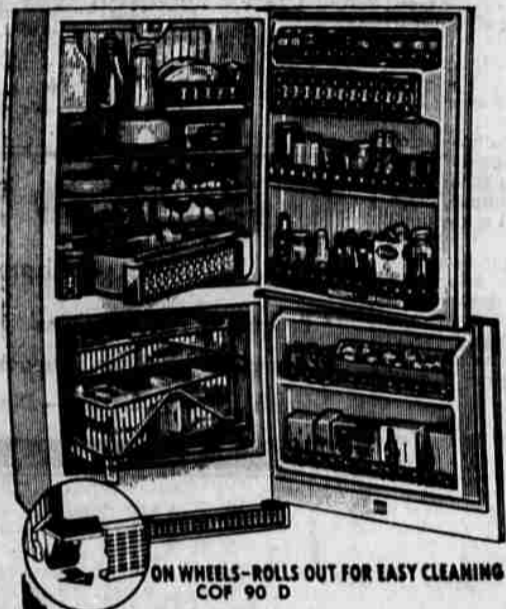
ON WHEELS - ROLLS OUT FOR EASY CLEANING COF 90 D