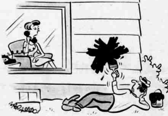
"Well, he's finally doing it, Mother, but he isn't crazy about it."

RELAX WITH A MOTHERS FRIEND MASSAGE a product of S.S.S. COMPANY-ATLANTA