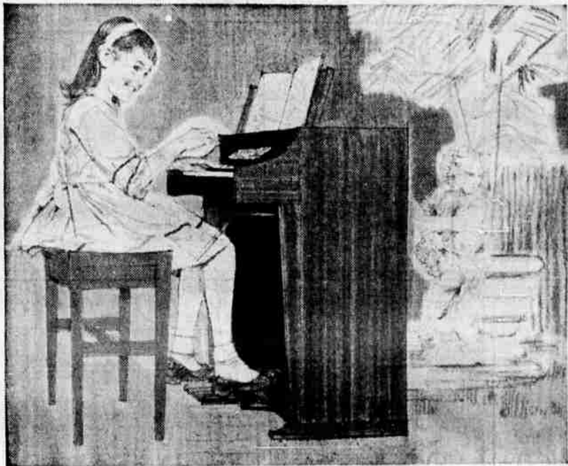
This Summer—Enrich your youngster's life with music