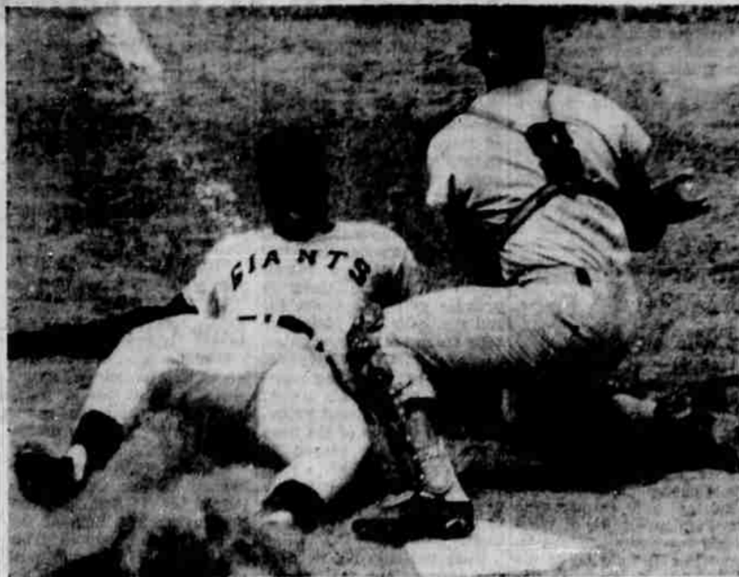
ANOTHER HOMER — San Francisco outfielder Willie McCovey is safe at home after scoring another home run off Los Angeles Dodger pitcher Don Drysdale. Dodger catcher John Roseboro waits for ball which arrived a split second too late on throw-in from centerfield. The Giants beat the Dodgers 8-3.

Ron Santo tallied ahead of the slender Texan, marking the 1,000th run batted in for Banks in his major league career.