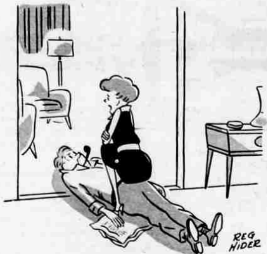
"I want to talk."