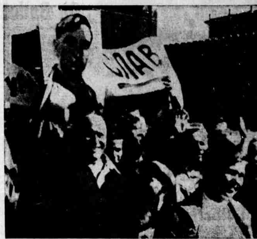
RUSSIANS CELEBRATE - Muscovites, celebrate in Moscow's Red Square after hearing some of them carrying banners and a portrait of cosmonaut Valery Bykovsky, celebrating the space shot. (UPI)

Mt. Ashland Road Bid Submitted at $652,763 Portland - (UPI) - A. L. Harding, Inc., of Stayton, Friday submitted the apparent low bid to build 7 1/2 miles of new road from U. S. Highway 99 to the proposed Mt. Ashland ski area. The bid was $652,763.82. Three other construction companies submitted bids to the U. S. Forest Service.