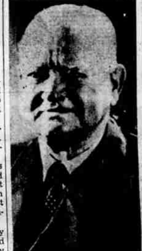
Herbert Hoover Seriously Ill

Saigon, South Viet Nam - (UPI) - President Ngo Dinh Diem and Buddhist leaders early today signed an agreement aimed at settling a five-week religious dispute here. Details were not immediately announced but Diem was reported earlier to have agreed to the final three of the five major Buddhist demands. Agreement was first reached Friday on the first two demands - giving Buddhists the right to fly their flag in public and changing of a government ordinance enacted under former Emperor Bao Dai which the Buddhists felt favored Christians. Diem and many top officials are Roman Catholics. Most Vietnamese are Buddhists. The Buddhist dispute was dramatically demonstrated last week when a Buddhist priest burned himself to death in public as a protest against the alleged religious discrimination. American officials said they were "relieved" at the rapid conclusion of the talks today and Saturday between Buddhist leaders and a special government committee headed by Vice President Nguyen Ngoc Tho. The agreement will become final when it is signed by President Diem and Supreme Buddhist Priest Thich Tinh Khiet. Today's talks lasted more than six hours. A Buddhist spokesman said the government accepted the third Buddhist demand that they be allowed to propagate their faith throughout South Viet Nam by promising to order officials at all levels not to harass Buddhist priests and nuns in the performance of their legitimate duties.