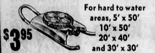
For hard to water areas, 5' x 50' 10' x 50' 20' x 40' and 30' x 30'

MELNOR/The No. 1 Name in Lawn Sprinklers and Hose Accessories