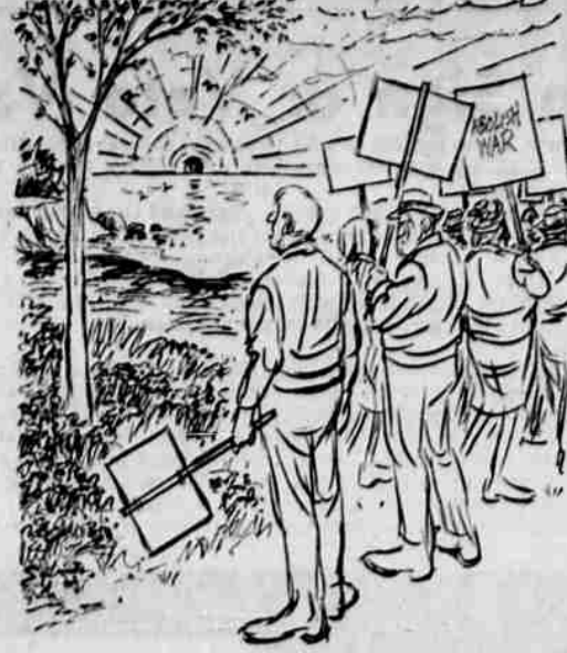
"You know, sometimes we get so involved in saving the world, we tend to forget why it's worth saving!"

THERE are two strikes against a couple which marries too young. They must face the problems of completing an education, getting a job, finding a place to live, trying to make ends meet, and, in many cases, adjusting to the care of small children — a responsibility too few are ready for.