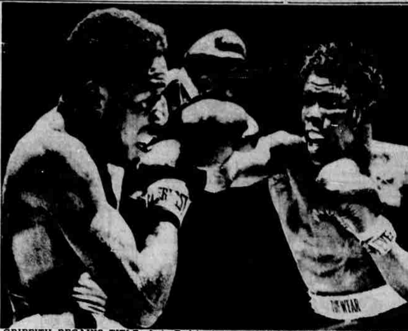
GRIFFITH REGAINS TITLE—Luis Rodriguez receives a right from Emil Griffith in the fifth round of their welterweight title bout at Madison Square Garden Saturday.