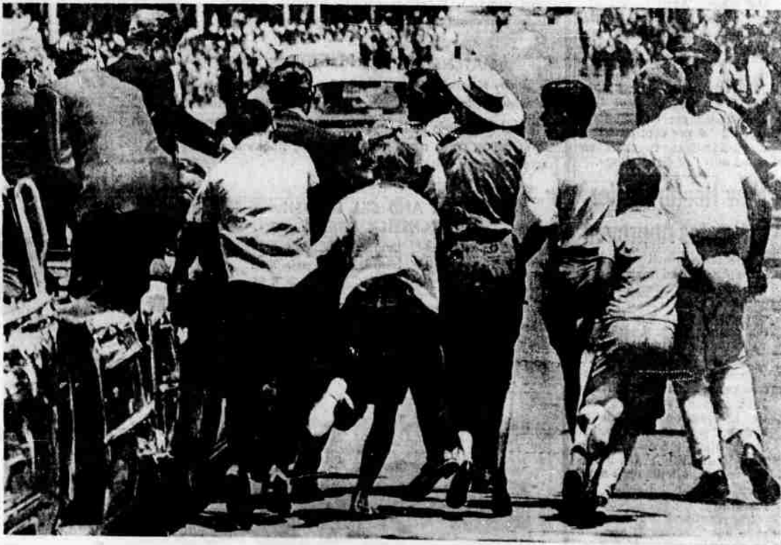
TRY TO SHAKE HANDS —A group of people lining the streets of China Lake, Calif., a Naval testing station, run out and try to shake hands with President Kennedy during his visit to the Naval Ordnance Testing station Friday.