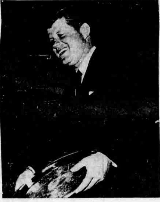
RECEIVES PLATTER —President Kennedy is shown receiving a silver platter from senior students of John Burroughs High school in Compton, Calif., with inscription "To a real American President." The presentation was made as he visited the grand ballroom where the seniors were holding their prom. A month ago hotel officials asked the seniors to relinquish their reservation to make way for a Presidential Dinner. The President intervened and moved into a smaller room.