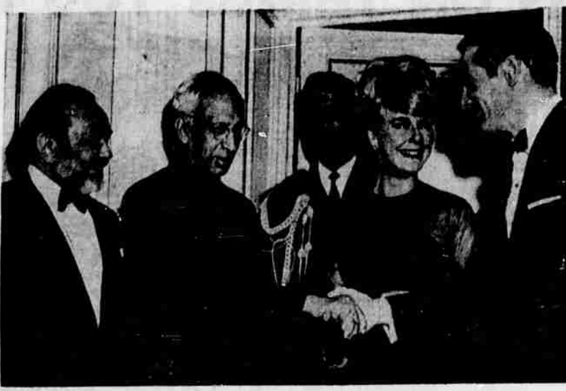
MEETS ACTORS —India's President, Dr. S. Radhakrishnan, shakes hands with actor Paul Newman as he visits the set of "The Prize" being filmed at MGM studios. At left is Edward G. Robinson and at center is German Actress Elke Sommer. The President was in Hollywood on a three-day visit.