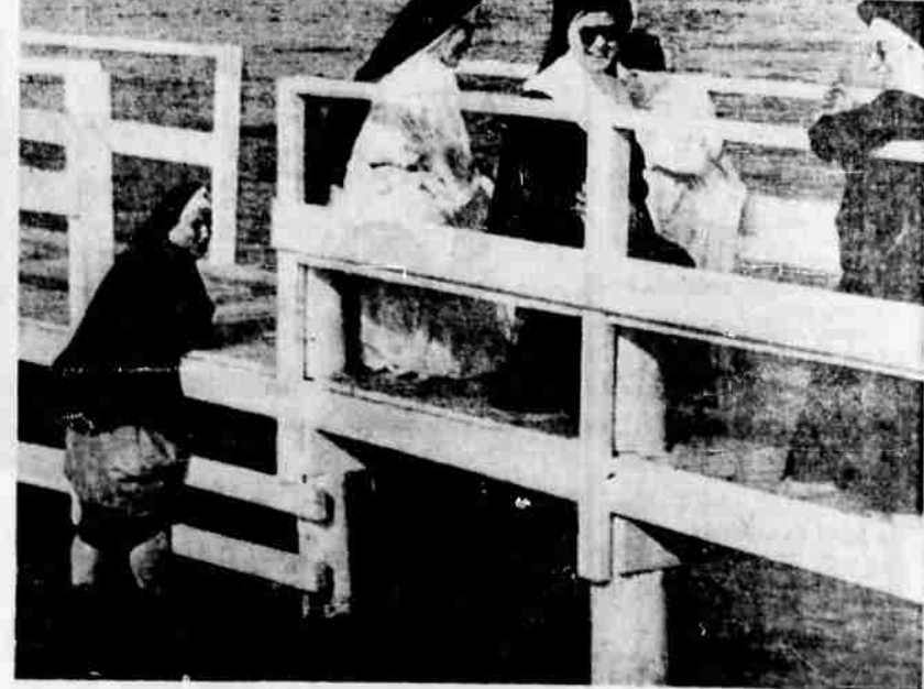
WADE IN LAKE —Warm weather encouraged this brave nun to wade in Lake Austin, even though she was being harassed by the other nuns sitting on the dock. Eighty nuns were having an outing at the Davenport Ranch west of Austin, Tex., Friday. The nuns are attending a special session at St. Edward's university, Austin.