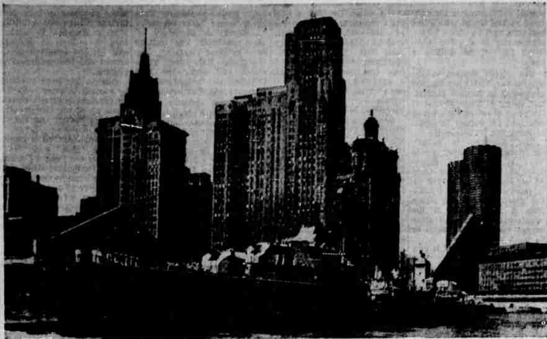
DESTROYER IN CHICAGO —The French heavy destroyer Bouvet is shown with Chicago's skyline in the background as it docked in Chicago Friday. It is the first French warship in history to drop anchor at Chicago's growing inland port. The Bouvet, part of a seven destroyer squadron, was given a 21-gun salute as it entered the port. While in Chicago, the 270 French sailors will be guests at a baseball game, dances, and other social events. (UPI)