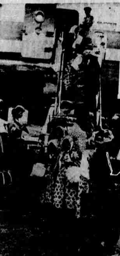
REMNANTS OF SECT —Members of a group of 224 "old believers," last remnants of Russian sect that took refuge in Turkey 300 years ago, get off a plane at Idlewild, New York. The group arrived from Ankara aboard two planes chartered by the intergovernmental committee for European migration. Their gaily colored Cossack costumes drew curious attention from modern travelers at the airport. Being of old Russian Orthodox faith, they wished to come to a Christian country instead of returning to "Godless Communism" in Russia or instead of remaining in Turkey, primarily a Moslem country.