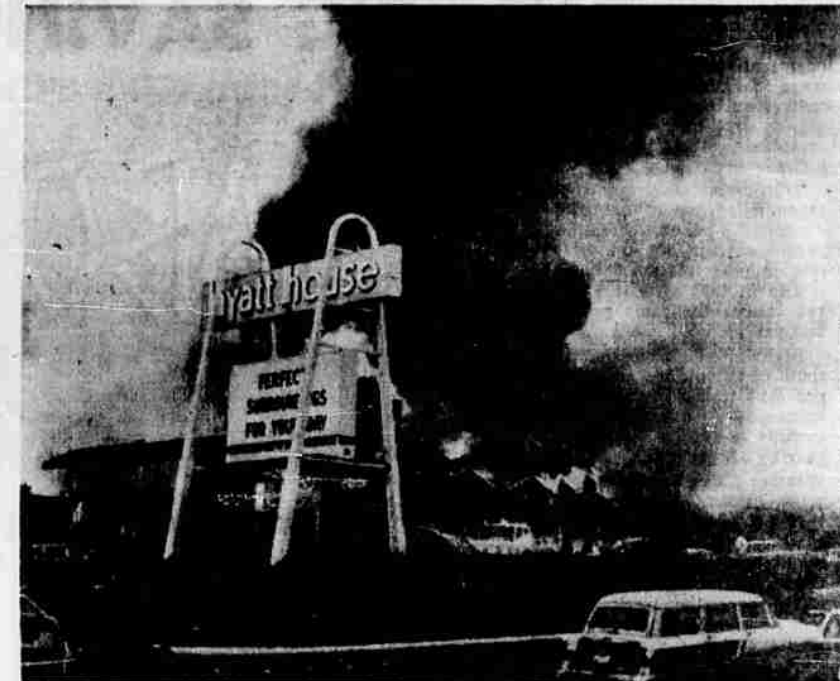
OUT OF CONTROL —An early morning fire Friday, which raged out of control for nearly two hours, destroyed the central portion of the Hyatt House, a luxury motel in Seattle. The fire started in a deep-fat fryer in the kitchen, and went on to destroy the building housing a kitchen, coffee shop, cocktail lounge and two banquet rooms. About 200 guests were roused from their sleep by the management, but did not have to be evacuated. Damage was estimated at $200,000.