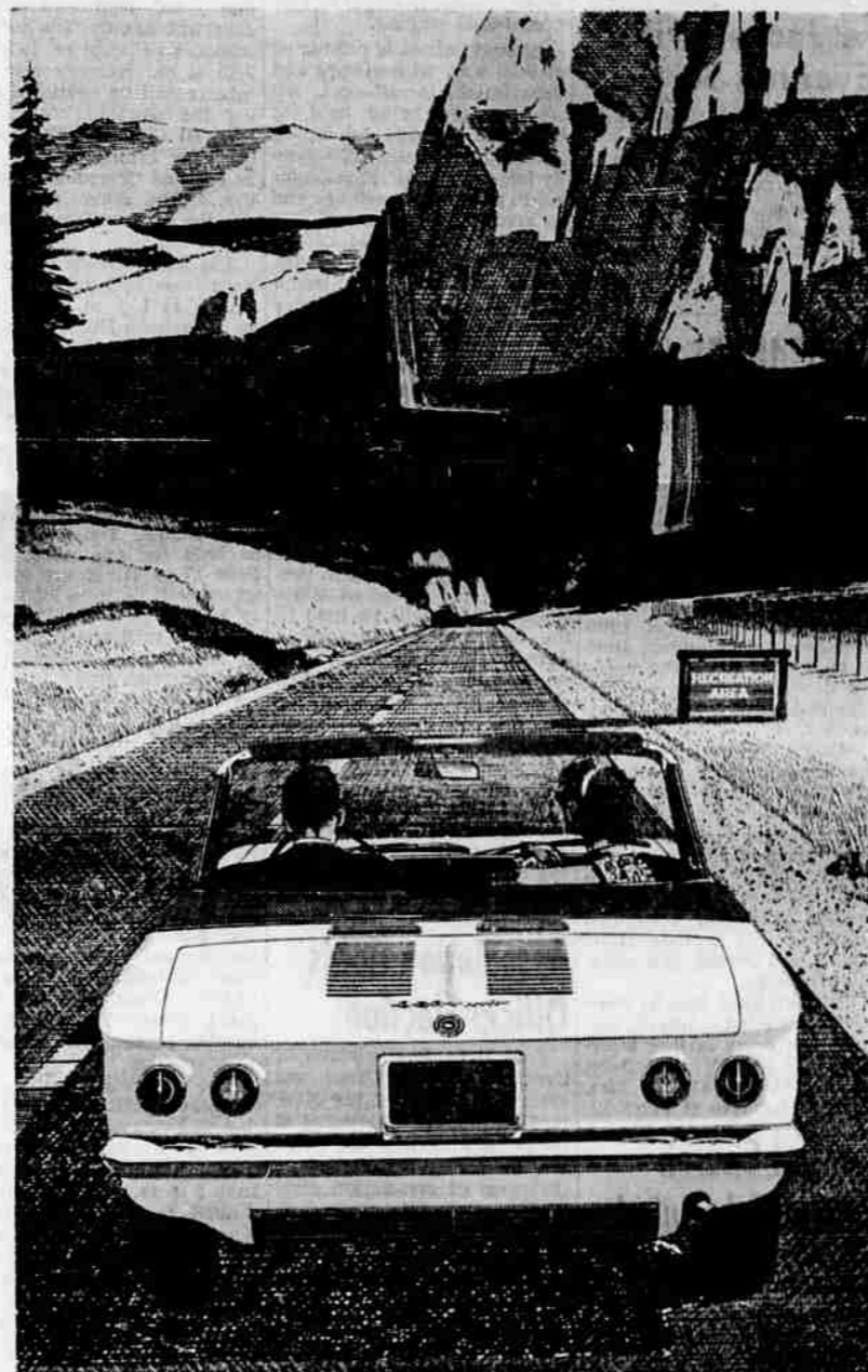
Monza Spyder Convertible

On June 29 paid-up club members will go on a picnic and then on to the Grants Pass Rogue Council square dance.