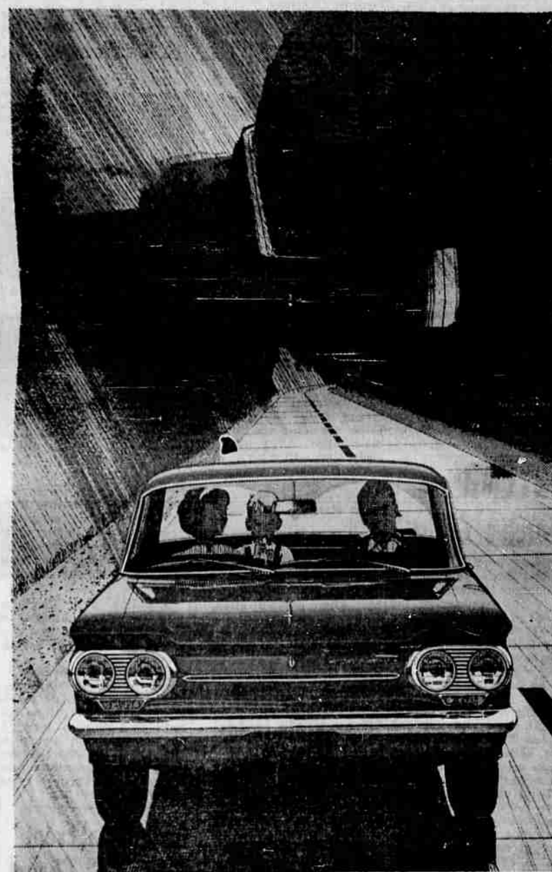
Monza Spyder Club Coupe