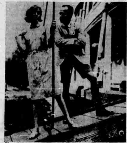
The shift - summer's most newsworthy fashion - goes sight-seeking in high style! This sleeveless version in barn red denim chambray has a shirt collar and white leather tie belt. Easy on the up-keep, it's made from Pepperell drip-dry cotton. Design by College-Town of Boston.