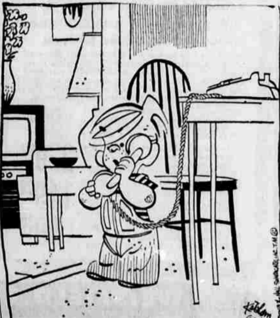
"DAD'S WORKIN' AN' MY MOM'S TAKIN' A BATH, MR. WILSON. I GUESS YOU'LL HAVE TO COMPLAIN ABOUT ME TO ME!"