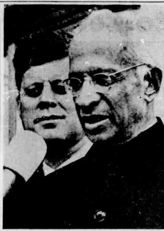
REPLIES TO GREETING — Indian President Sarvepalli Radhakrishnan, right, replies to President Kennedy's greeting with a few remarks on the north portico of the White House in Washington. Rain cancelled an elaborate welcoming ceremony for Radhakrishnan, who is in the capital for a business conference with the President.