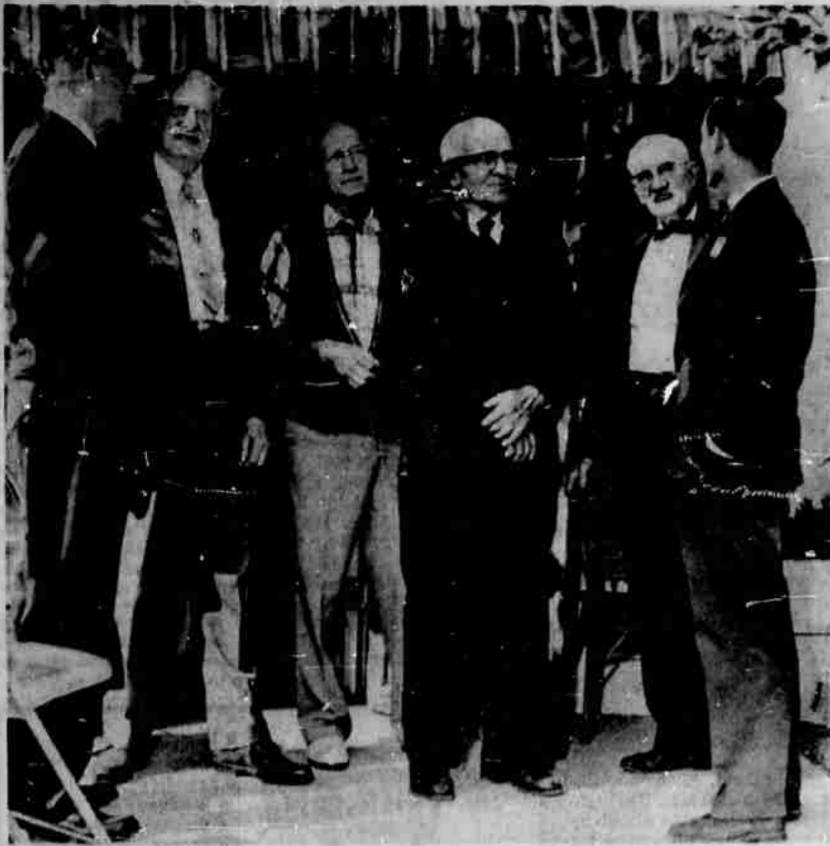
Pictured above is a group of men who participated in open house activities last week end at the Senior Activity center on East Jackson street.

include dancing, language classes, painting lessons, instruction in sculpture, knitting, bridge, mosaic making and many others.