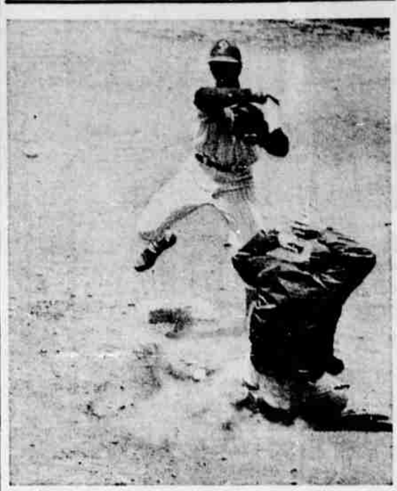
FORCED OUT — Chicago Cub's Dick Ellsworth is forced out on second as Phillies Second Baseman Tony Taylor throws to First Baseman Roy Seivers to try to catch Chicago's Ken Hubbs, whose drive to Don Hoak started the play in the third inning at Connie Mack stadium Saturday.